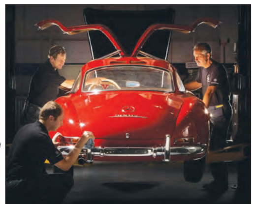
Mercedes-Benz restoration workshop.