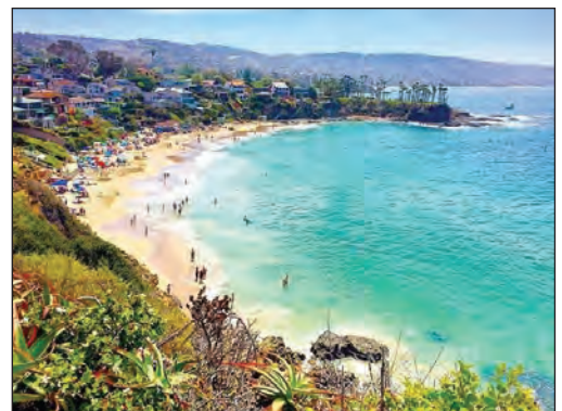
View of Laguna's Crescent Bay from Las Brisas restaurant