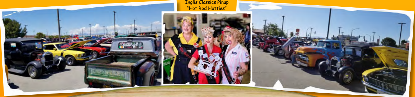
Meet the Inglis Classics Pinup "Hot Rod Hotties"

Saturday, May 28, 2022 9:00 AM to 1:00 PM Sunland Ford Dealership 15330 Palmdale Rd. Victorville