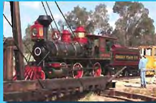
Train Rides & Attraction