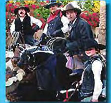
Fables Of The West

The Orange Empire Railway Museum is 79 acre park, home to antique trains, trolley, cable cars and exhibits. Enjoy a day of fun in the park with live Music! Potato festival and vendors featuring The California Experience with 7 educational exhibits. Children can pan for "real fools gold", make adobe bricks, work with clay, learn about rope making, Iron forging, glass blowing and spinning/weaving textiles just like they did in the old days. Best of all its free!