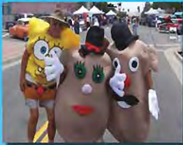
Potato Pete & Patty