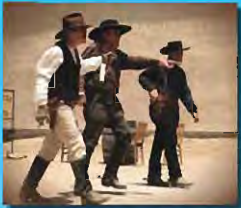
Old Town Temecula Gun Fighters

Live Entertainment. Bands. Vendors. Festival Foods. Exhibits. Drawings. Youth Activities. Story Telling And Potato Doll Dressing. Youth Talent Show. Custom Bicycle Show . Free Pony Rides For Kids