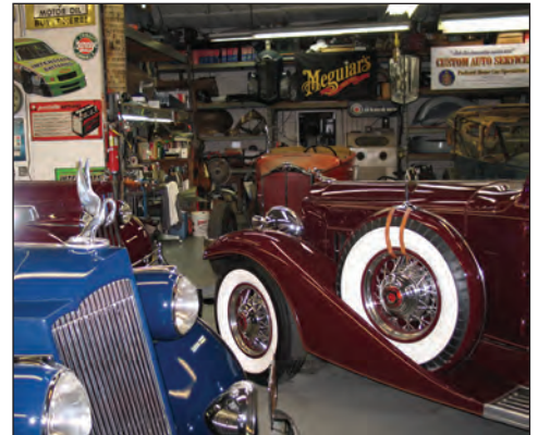
Club Headquarters at Custom Auto Service in Santa Ana where you'll see fabulous cars in various stages of restoration.

4:00–8:00 PM Mexican buffet at Club Headquarters located in historic Downtown Santa Ana, with a brief business meeting. Packard parking on the southeast corner of Third and French Streets.