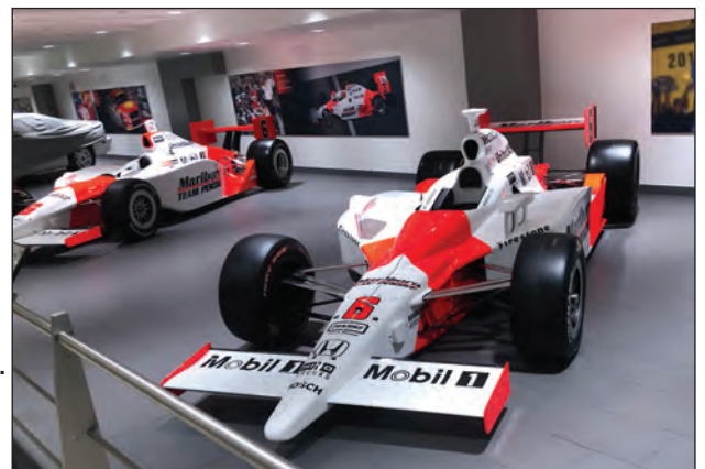
PI will be the first car club to host an event at Roger Penske's Indianapolis 500 race car collection.

7:50 PM Presentation of trophies by Tom Scheil, head judge.