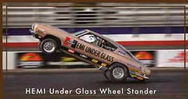
HEMI Under Glass Wheel Stander

Please bring a NEW $10.00 Unwrapped Toy!